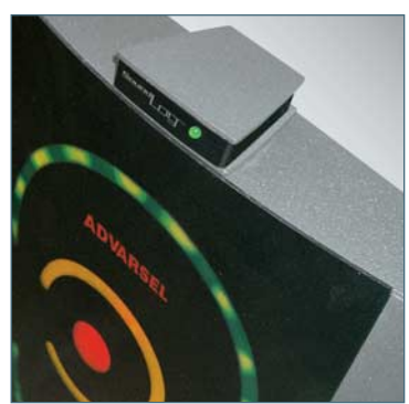
SoundLog consists of a new version of SoundEar®2000 with a built in log function.

SoundLog is SoundEar<sup>®</sup>'s logbook. SoundEar<sup>®</sup> measures sound and SoundLog stores the information. Using the computer program that comes with SoundLog, you can see measurements carried out over a period of up to four weeks at a time on a ready-to-print graph. SoundLog consists of a new version of SoundEar<sup>®</sup>2000 with a built in log function.